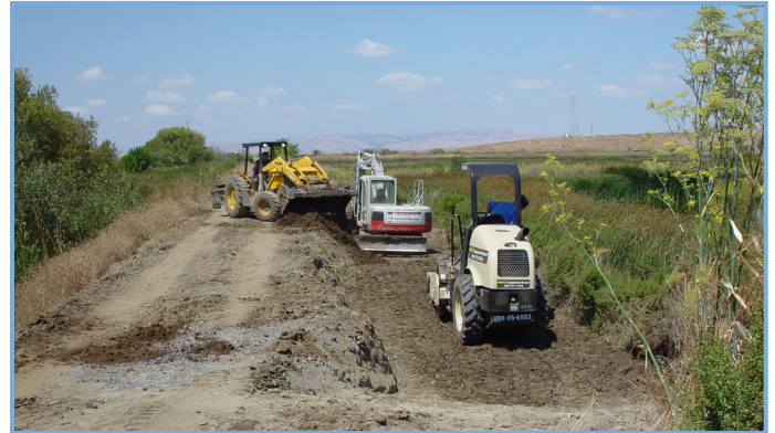
Repair of levee due to erosion along Calabazas Creek (2006).

Vegetation growth, if abundant, can restrict channel capacity, particularly at constricted locations such as bridge overpasses, culverts and other river crossings. Thick vegetation on a levee slope makes it difficult to detect rodent burrows. Root systems from vegetation can also damage the system's integrity.